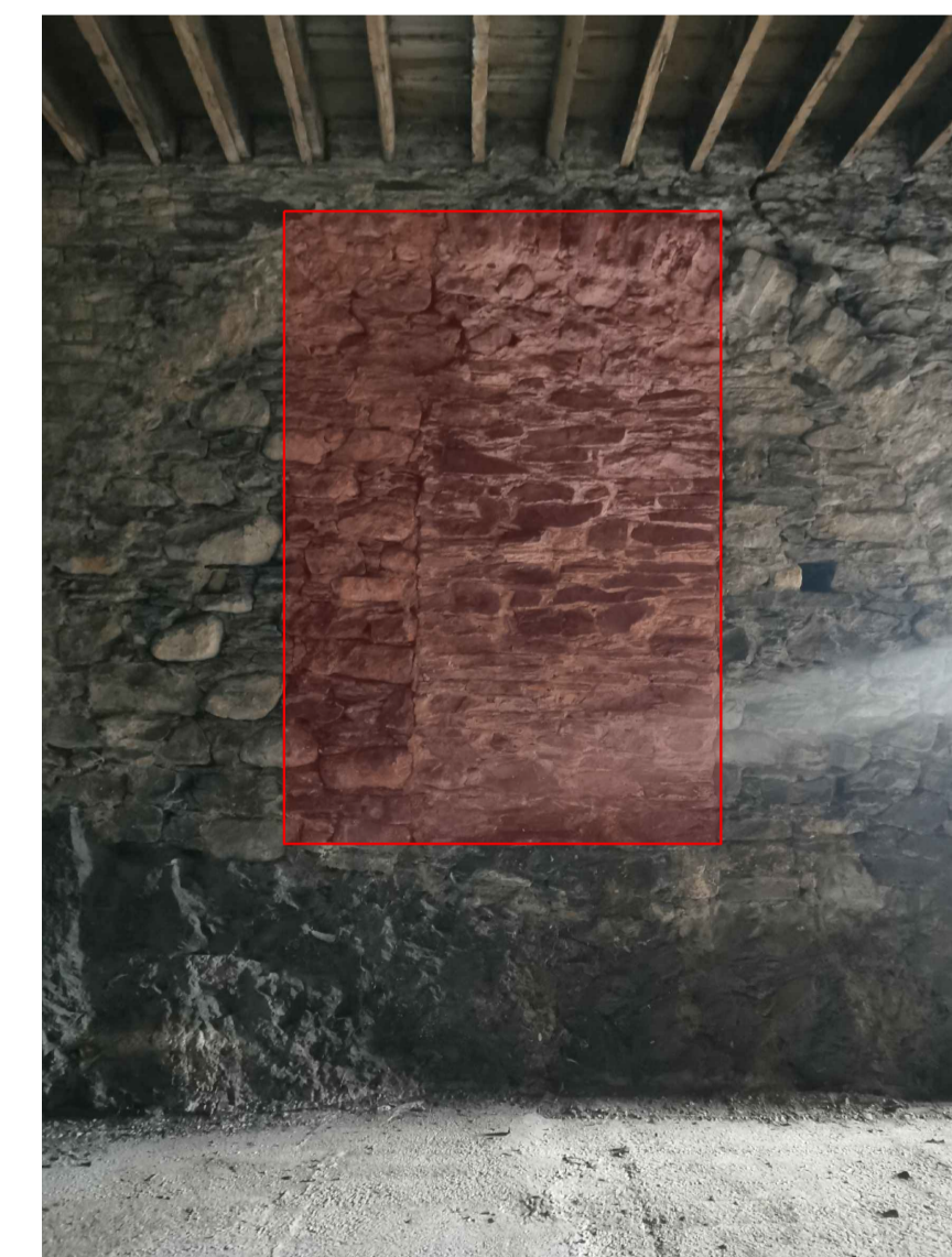
04 Image of Existing wall of the location of Intervention 01 Scale: 1:20